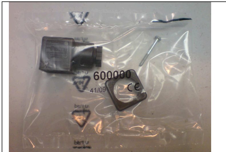
Figure 2 - Example of a Single Packaged Mounted Connector

100 bags of mounted connector assemblies is placed in a carton for shipping; reference Table 2 below for carton part numbers.