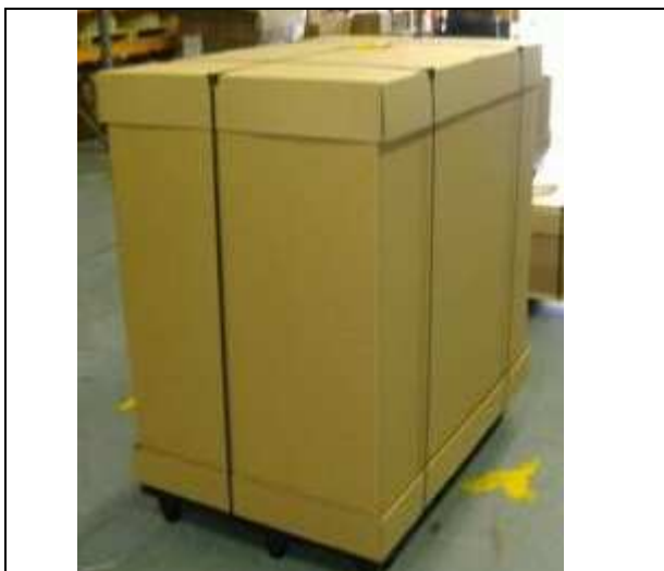
Figure 5 – Boxes contained in a Pallet box