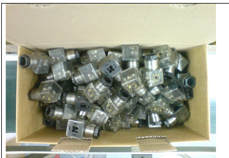
Figure 1 - Example of bulk pack mounted connectors

This constitutes a kit of 100 mounted connectors.