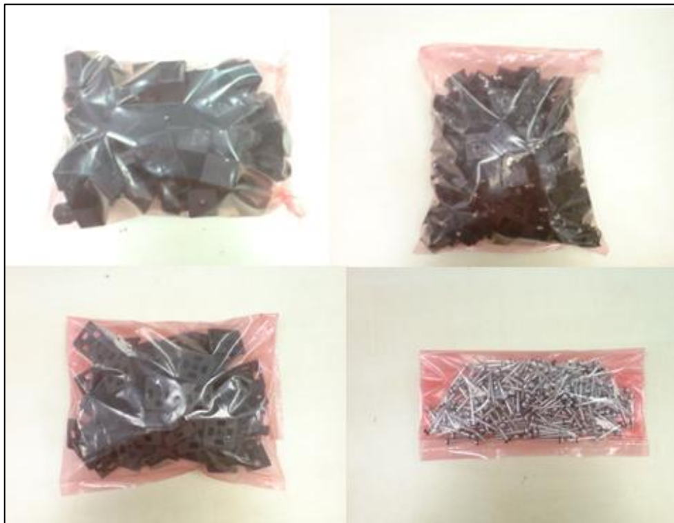
Figure 3: Bulk pack Unmounted part numbers