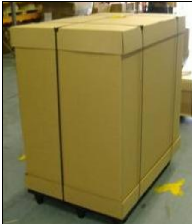
Figure 7: Pallet box