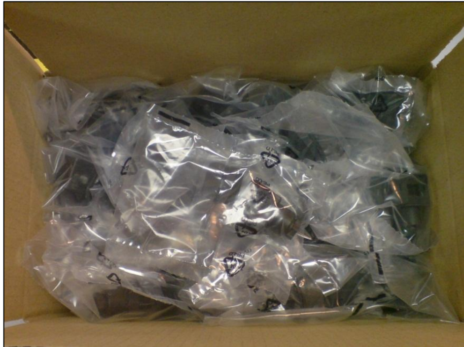
Figure 1: Example of single pack unmounted parts

Bags of connectors are placed in a box for shipping; reference Table 1 below for box part numbers and SPQs.