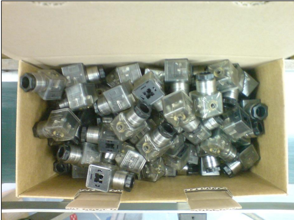
Figure 2: Bulk pack mounted part numbers (bags of screws or gaskets not shown)